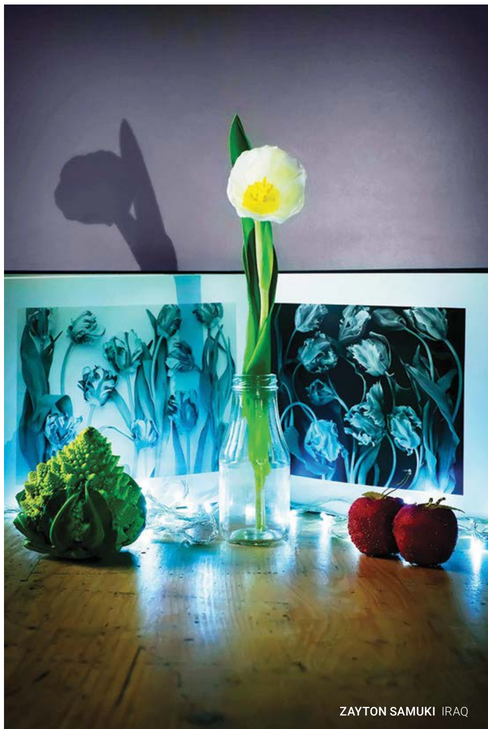
ZAYTON SAMUKI IRAQ