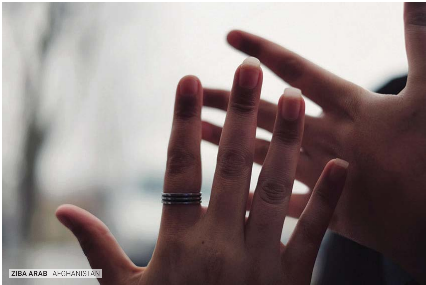
ZIBA ARAB AFGHANISTAN