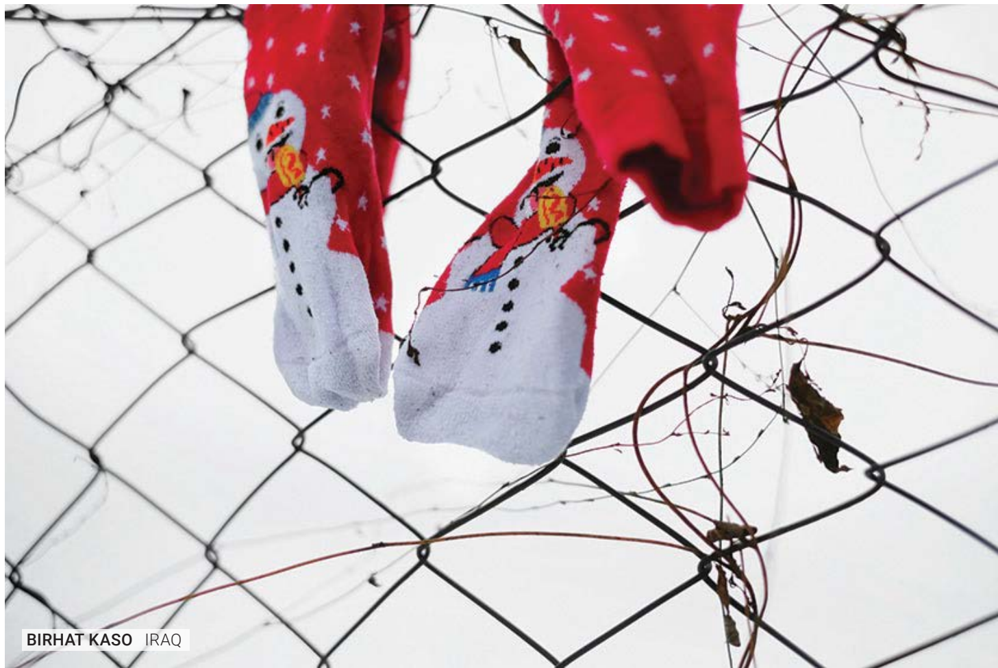
BIRHAT KASO IRAQ