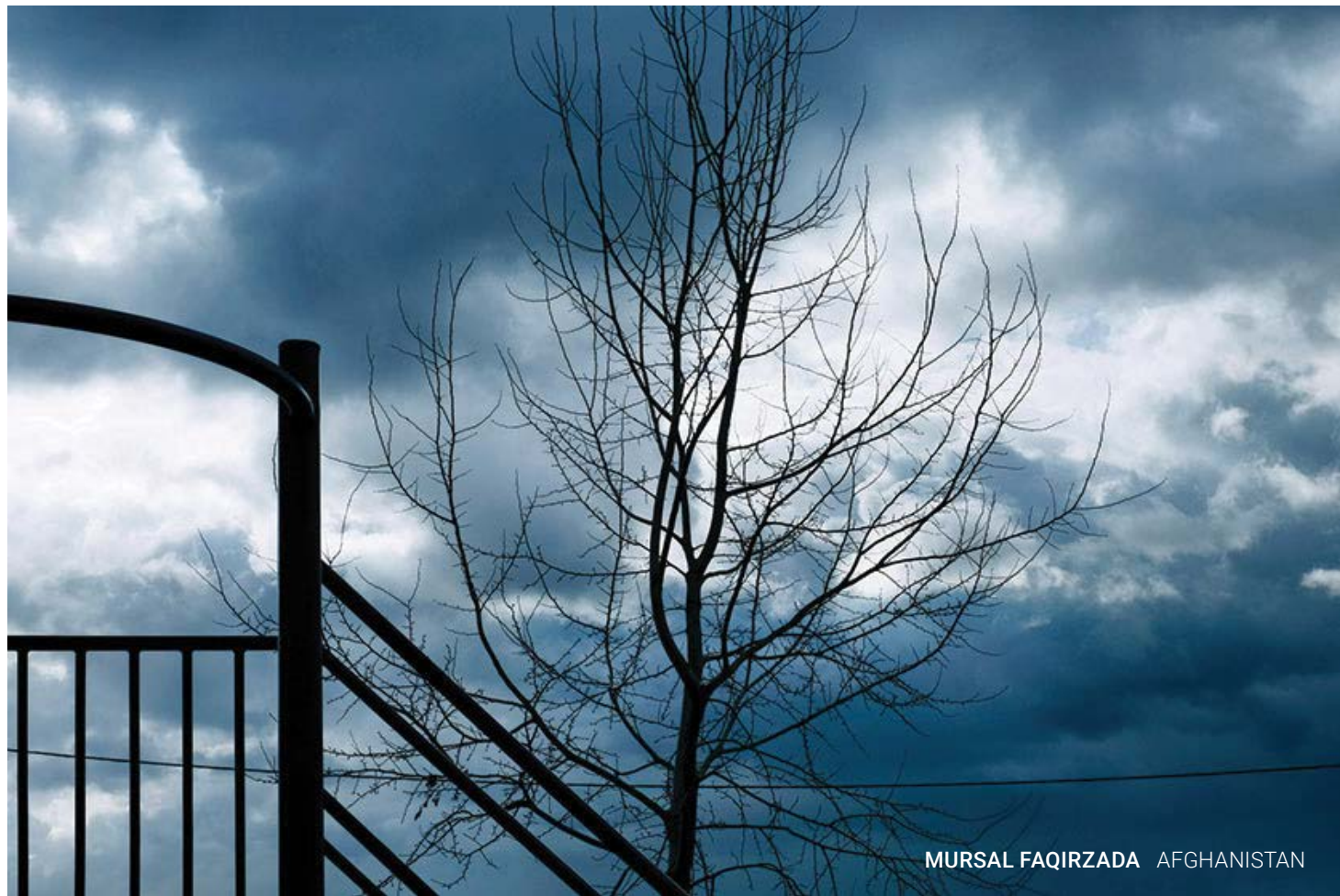
MURSAL FAQIRZADA AFGHANISTAN