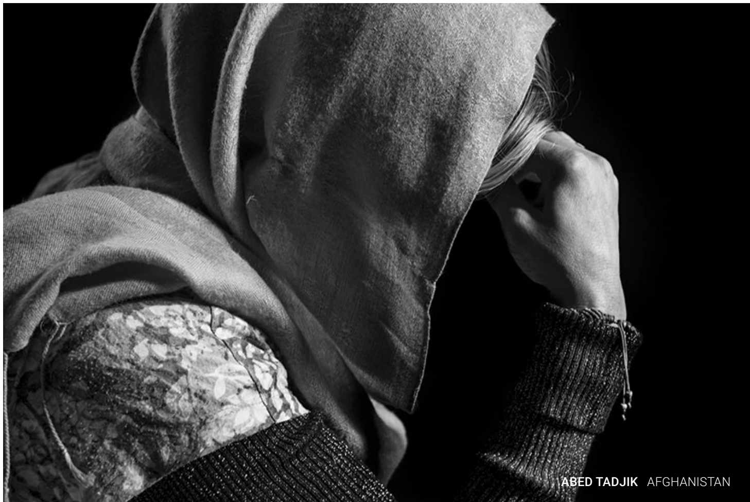
ABED TADJIK AFGHANISTAN