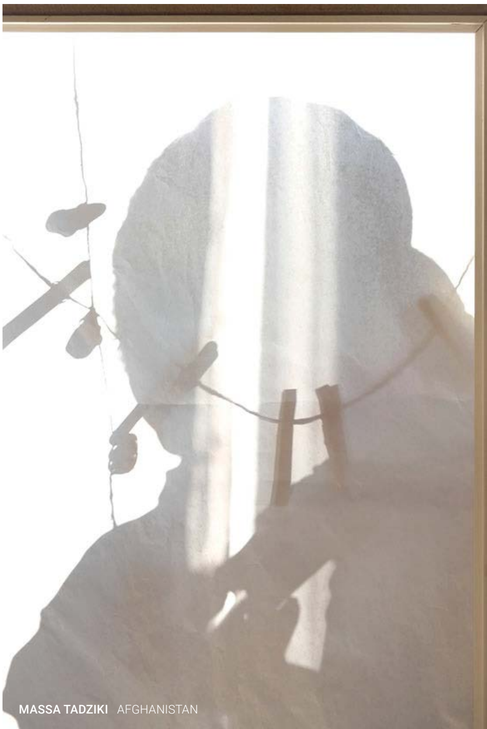
MASSA TADZIKI AFGHANISTAN