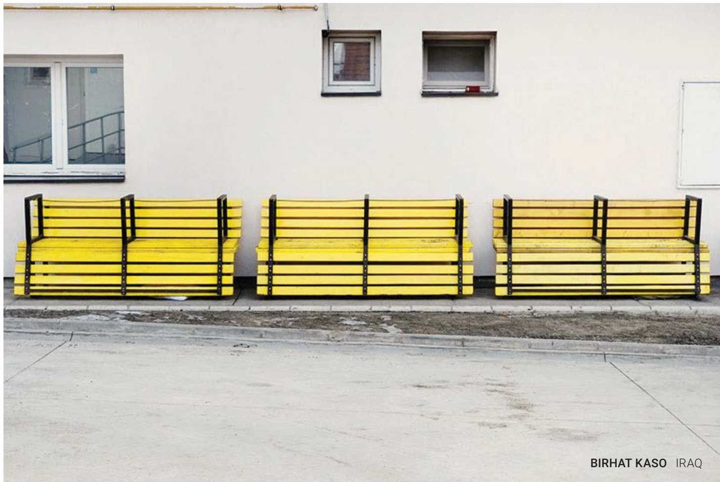
BIRHAT KASO IRAQ